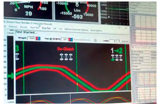
Customizable drive cycles include speeds and grades