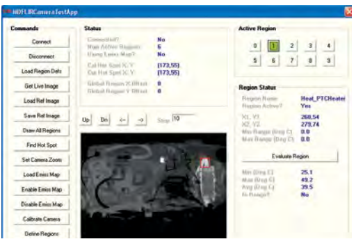
Thermal Imaging and vibration analysis are commonly integrated into EOL test stands. Thermal images on key under hood points before and after cycle testing allows QA engineers to establish pass/fail criteria based on areas-of-interest and temperature limits.